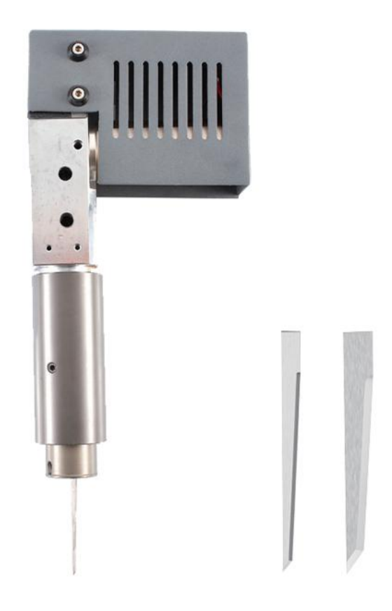
Foam Cut Tool FCT