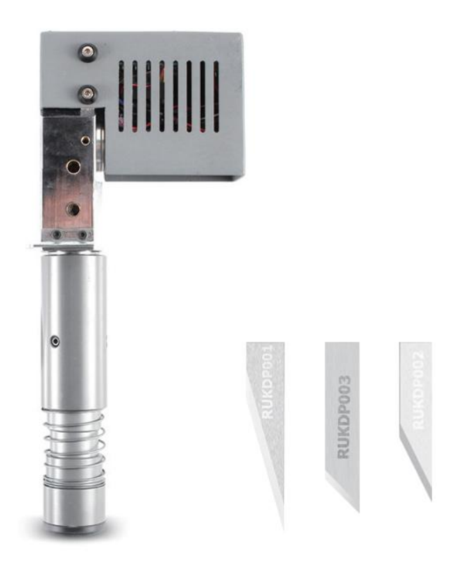
High-Speed Oscillating Tool EOT