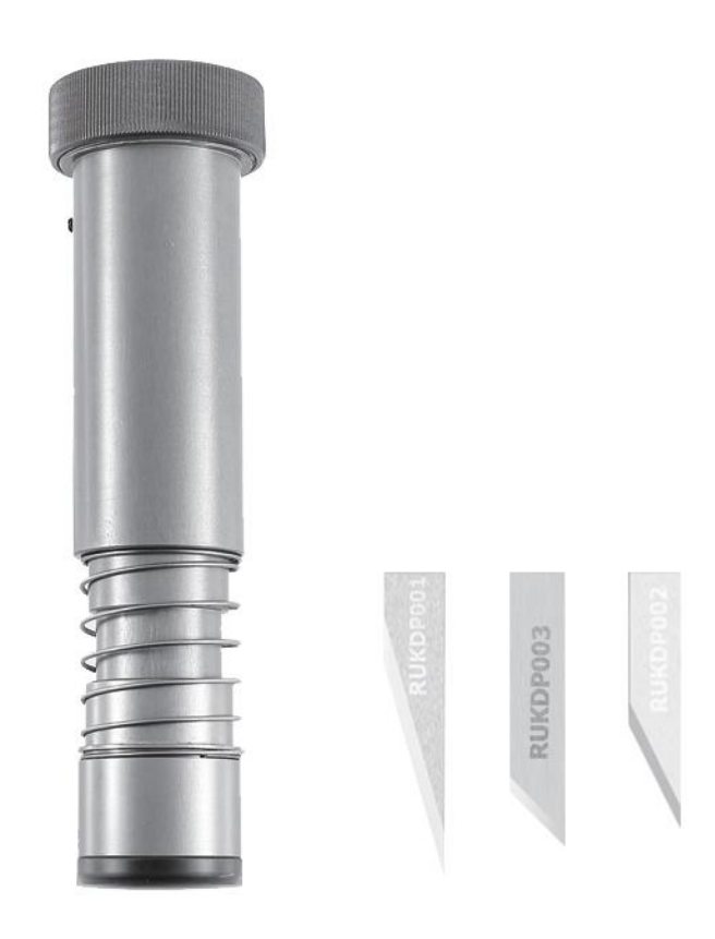
Universal Cutting Tool UCT