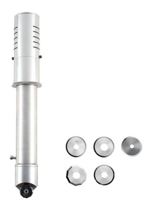
Driving rotary tool DRT