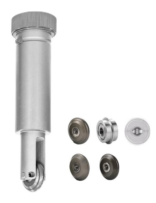
Creasing Wheel CW