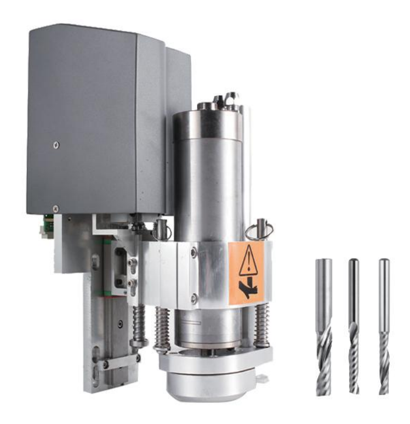
Water-Cooled Milling Tool MT